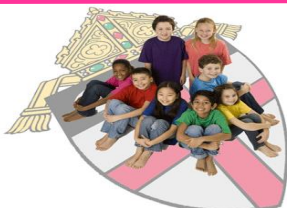
Diocese of Harrisburg Youth Protection Program

Call the Parish Office for Contact Information