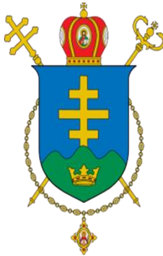
Coat of arms