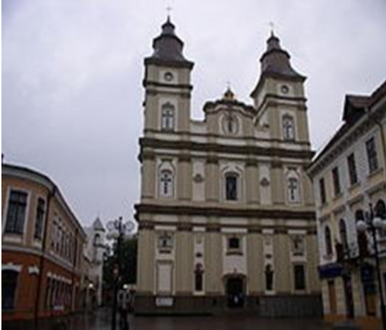
Cathedral of the Resurrection