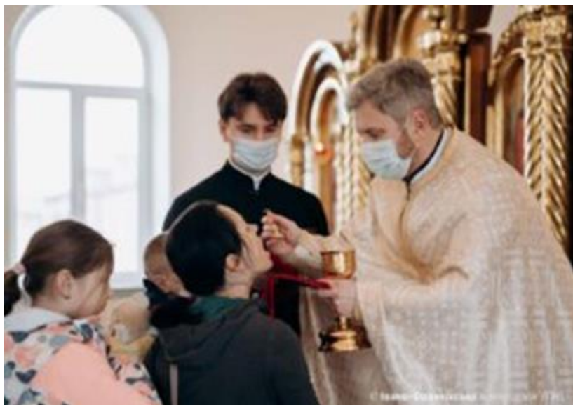
A priest gives Communion to people displaced by war, at the Ivano-Frankivsk Theological Seminary of St. Josaphat in Ivano-Frankivsk, Ukraine, in this March 2022 photo. The Ukrainian Catholic Archeparchy of Ivano-Frankivsk is hosting more than 1,200 displaced people from other parts of Ukraine. In addition to parish houses throughout the archeparchy in Western Ukraine, guests are staying at the seminary, a church-run summer camp at Podlyute and St. Basil the Great High School in Ivano-Frankivsk.