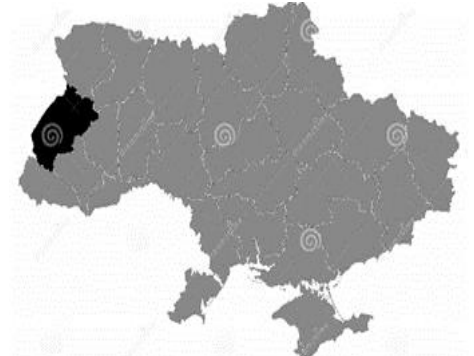
Map of the Ukrainian Catholic Church in the province of Lviv in 1939