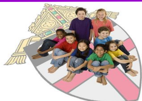
Diocese of Harrisburg Youth Protection Program

Call the Parish Office for Contact Information